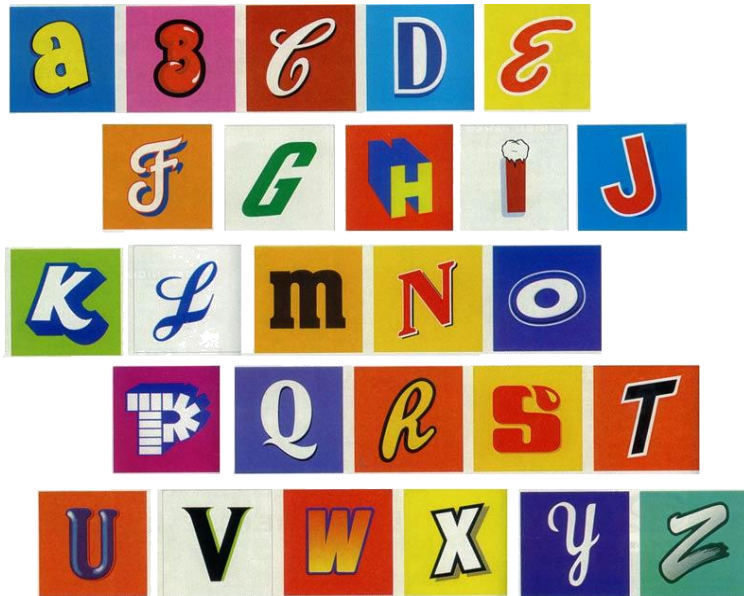
Table 2 The ABCs of Branding

These ABCs were not learned in school, but literally millions of people have mastered them. And that brands influence choices was recently demonstrated again in a study that showed that, when given a choice of an identical food in a branded wrapper versus an unbranded wrapper, children will choose the food in the branded wrapper as being tastier (Robinson, Borzekowski, Matheson, & Kraemer, 2007). These choices have profound implications in educating a whole child.